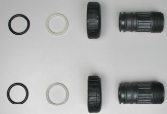
Order No. V3007-14