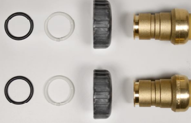
Order No. V3007-13