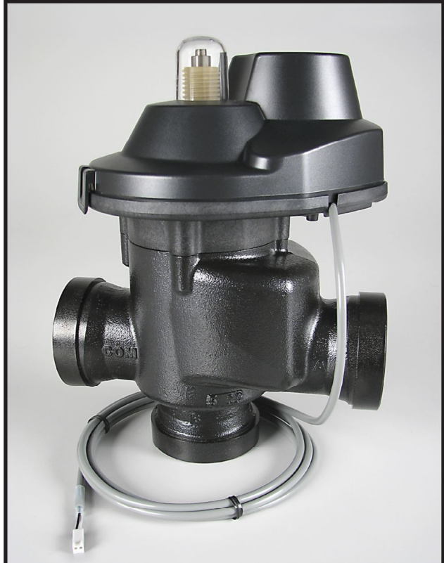
2.0" Motorized Alternating Valve

Order No. V3063 • NPT Order No. V3063BSPT • BSPT