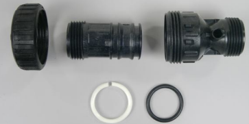
Order No. V3008-03