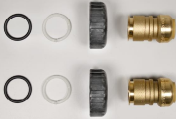
Order No. V3007-12