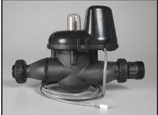
1" & 1.25" No Hard Water Bypass Valve

Order No. V3070FF • F x F Order No. V3070FM • F x M