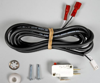
Order No. V3014