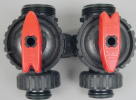
Order No. V3006