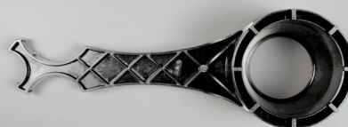
Order No. V3193-02