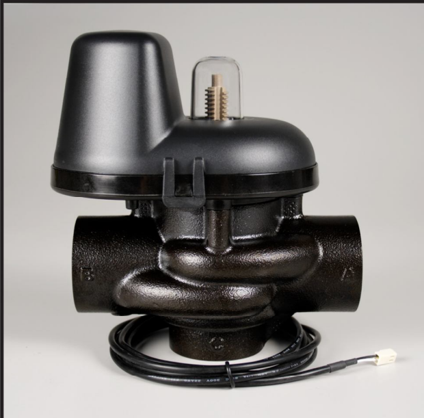
1.5" Motorized Alternating Valve

Order No. V3071 • NPT Order No. V3071BSPT • BSPT