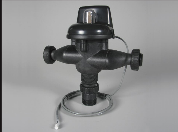
1" & 1.25" Motorized Alternating Valve

Order No. V3069FF • F x F Order No. V3069MM • M x M