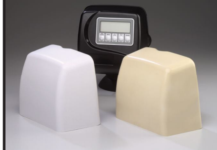
Order No. V3175WC-W • White Order No. V3175WC-A • Almond