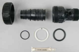
Order No. V3008-04